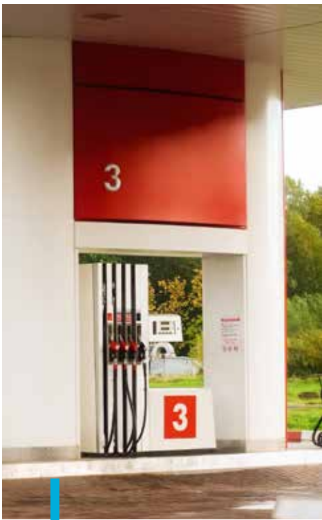
GENERAL SIGNAGE DIGITAL SERIES MPI 1005 MPI 2000 MPI 2900 MPI 3000 MPI Value Film SIGN CUT SERIES 900 SC 700 PF 500 EF 450 GS REFLECTIVE SERIES HV 1200 HV 1100