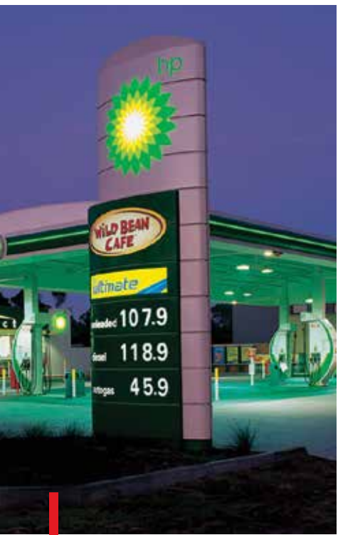
ILLUMINATED SIGNAGE DIGITAL SERIES MPI 2150 Matte SIGN CUT SERIES 5500 QM UC 900 Translucent 4500 TF 450 GS 5100 5300