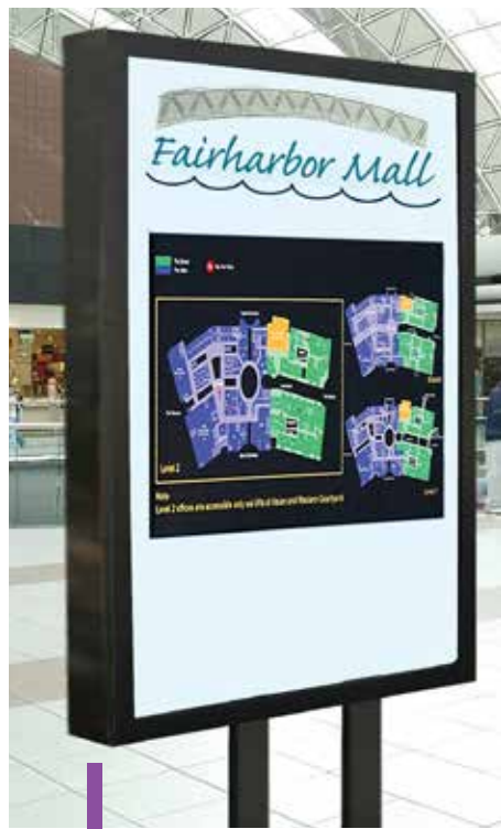
WAYFINDING DIGITAL SERIES MPI 2000 SIGN CUT SERIES 900 SC 700 PF 500 EF 450 GS REFLECTIVE SERIES HV 1200 HV 1100